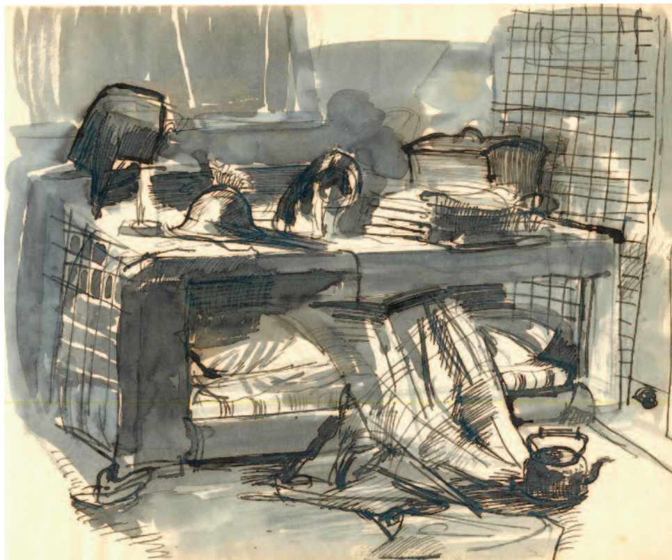
9. Cat perched on a Morrison shelter, 1944 , pen and blue ink,