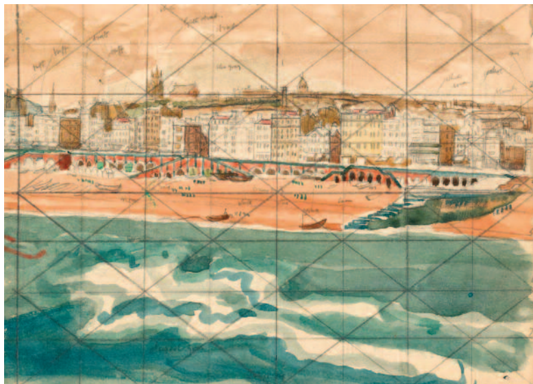
27. View from a drawing room window, Brighton Watercolour, 18 by 12.5 cm