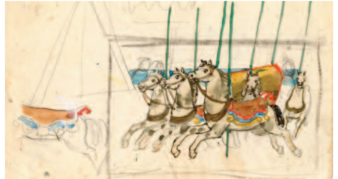
18. Brighton Fairground, Looking up towards the Racecourse , Watercolour, 18 by 22.5 cm