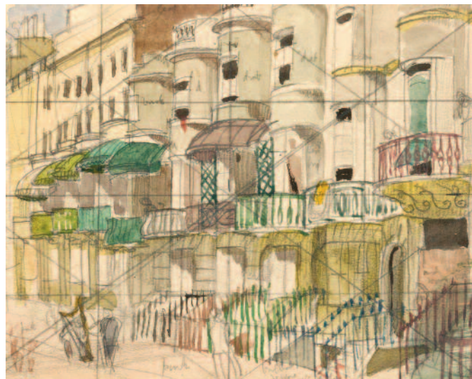
19. A Brighton Terrace , watercolour, 13 by 16.5 cm