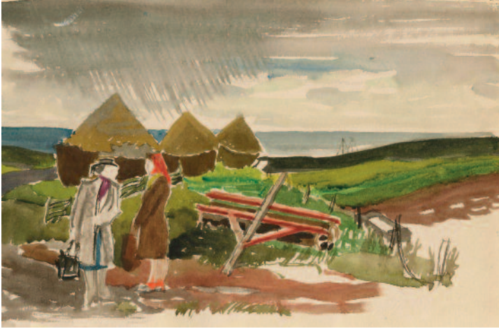
15. Farmland near Brighton, possibly near Roedean School , Watercolour, 17 by 27 cm