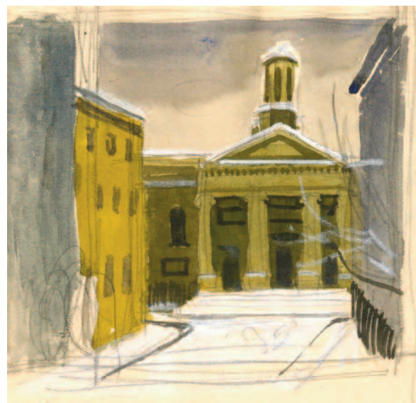
32. Christ Church, Brighton Unitarian church Watercolour, 15 by 12 cm