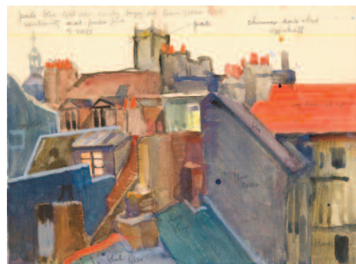
8. Dieppe Rooftops and the Eglise St. Remy beyond , watercolour, 13 by 16.5 cm