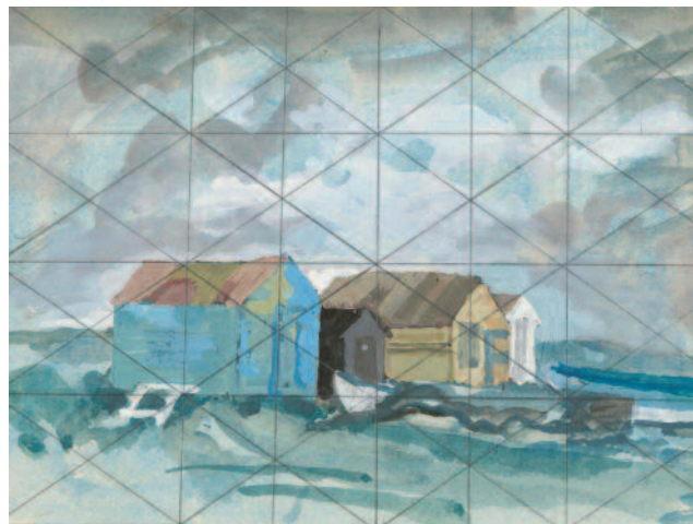
22. Fishing Boats on the Shingle, Brighton , watercolour, 13 by 17 cm