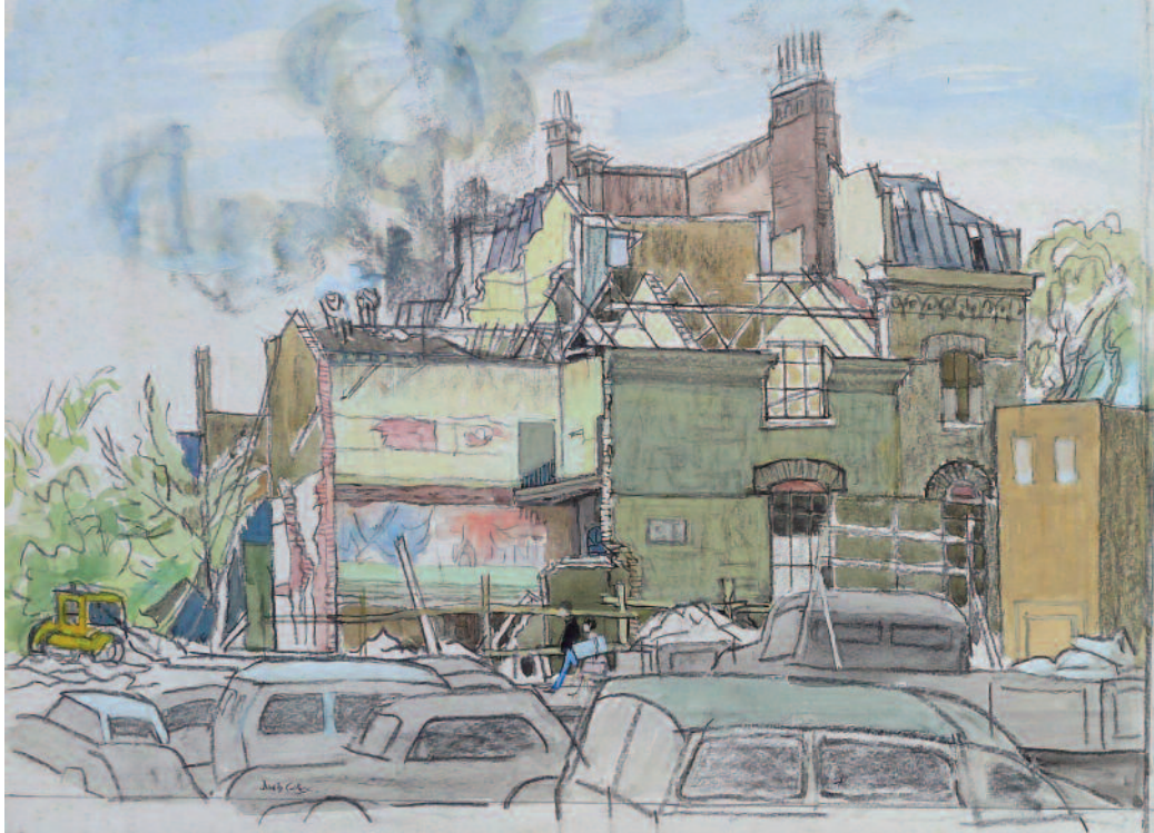
25. Demolition of the Brighton College of Art, c.1964 signed, inscribed extensively and stamped: NC Watercolour over pencil and crayon, 29.5 by 42 cm

One of a series of drawings recording the demolition of the old Brighton College of Art in Grand Parade. As a mark of respect she titled many of the drawings "Requiem". Some are now held by Brighton University.