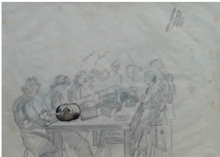
12. WAAF Mechanics at Work , c.1941, pencil