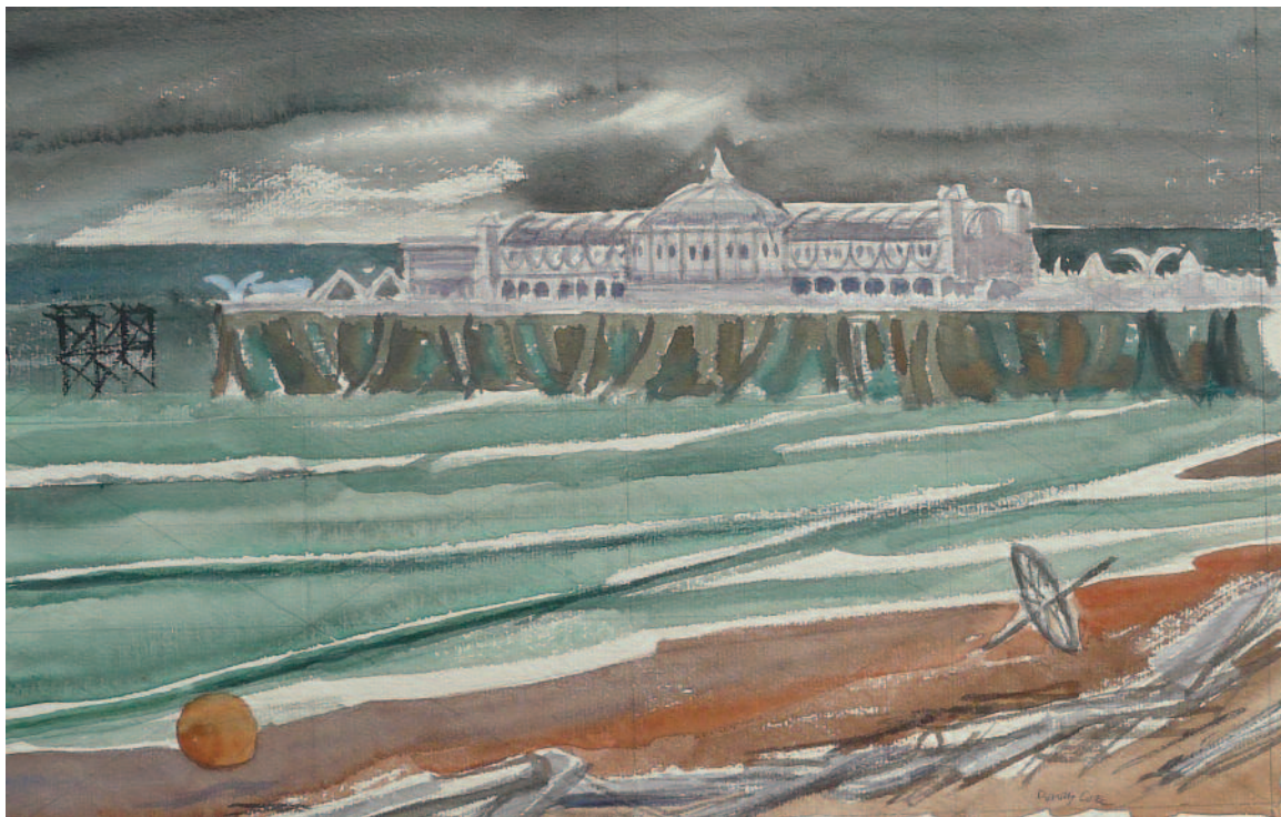
10. Palace pier Brighton during the war inscribed with title watercolour,

The Palace Pier in Brighton was sectioned during the War - a piece was taken out between the root end and the pier head to prevent it from being used by the enemy in the event of an invasion.