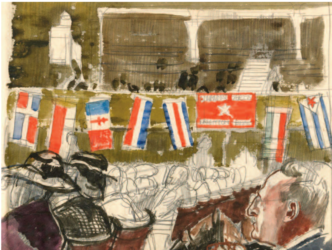
11. Communist party meeting, Brighton Beach, 1940s watercolour over pencil, 19 by 20 cm