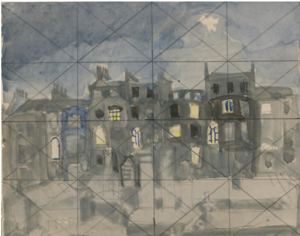
30. Rooftops, possibly Kemp Town