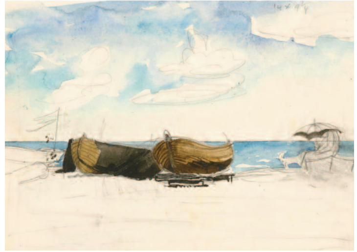
3. Fishing Boats on the Shingle, Brighton,