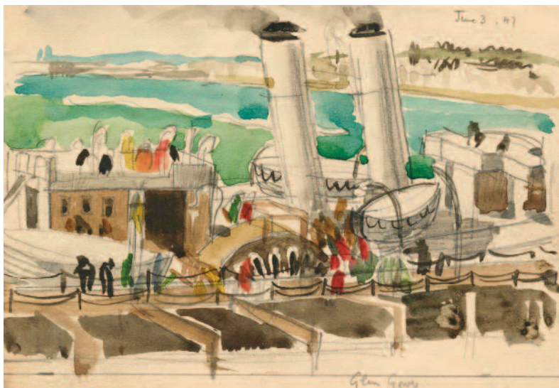
31. Paddle Steamer, Palace Pier Watercolour, 15 by 17 cm