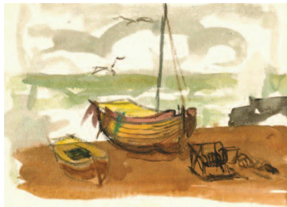
24. Fishing Boats and Winch, Brighton , watercolour, 13 by 17 cm