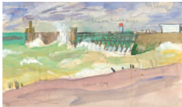
21. Waves on a Stormy Morning , watercolour and gouache, 10.5 by 17 cm