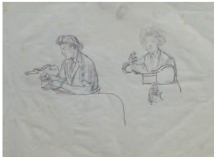
14. Military Hospital , c.1942

Catalogue nos. 12 and 13 both relate to a watercolour that was commissioned from Coke by the War Artists Advisory Committee. It shows mechanics from the Women's Auxiliary Air Force at work on munitions. That watercolour is now in the Imperial War Museum (cat.no.LD 1298).